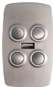
2-mot insert Switch_Metal_USB_V2