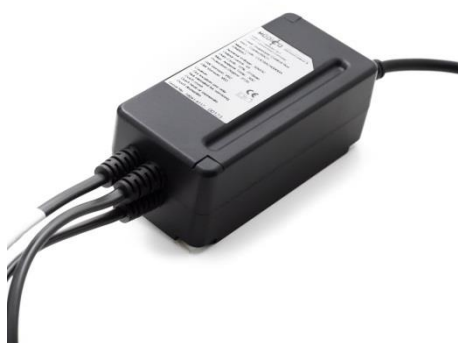
2- Mot sequence control unit