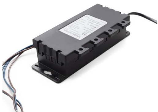
LCR 3-mot Relais Box