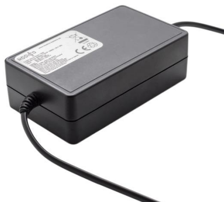
Lithium Ion Accu Pack; 1300mAh